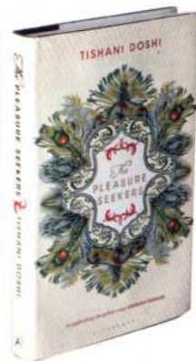
The Pleasure Seekers Tishani Doshi

Before she wrote this, her first novel, Chennai-based Tishani Doshi's first collection of poetry, Countries of the Body , won the Forward Poetry Prize for best first collection. That perhaps explains the lyrical quality that permeates most of The Pleasure Seekers , a delightful family saga inhabited by engaging characters. The story spans from 1968 to 2001 and starts with Babo becoming the first member of the Patel family to leave from Madras to London for further education. He ends up marrying Sian Jones, a cream-skinned girl from Wales and the two set up home in Madras. The story then explores the lives of the two and their two daughters who follow, Mayuri and Bean.